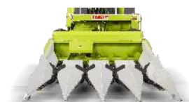
BETTER ADAPTABILITY OF ROW SPACING Wider position of front dividers and hoods allows picking of even those plants which are not in line.