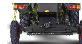
HEAVY DUTY REAR AXLE Inline rear Axle with detachable ballast weight, especially designed for Maize Fields