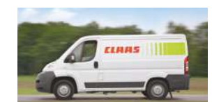
FIRST CLAAS SERVICE® Dedicated after-sales service network ensures spare parts supply along with reliable customer service.