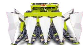
BETTER SERVICEABILITY OF CUTTER BAR Foldable design of front dividers and hoods for better serviceability